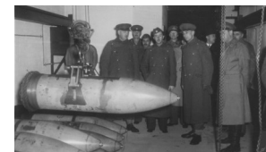
One of the Wanstone battery magazines.

Spot the soldier silhouettes Soldiers strategically placed around St Margaret's with QR codes for lots of local historical facts and information.